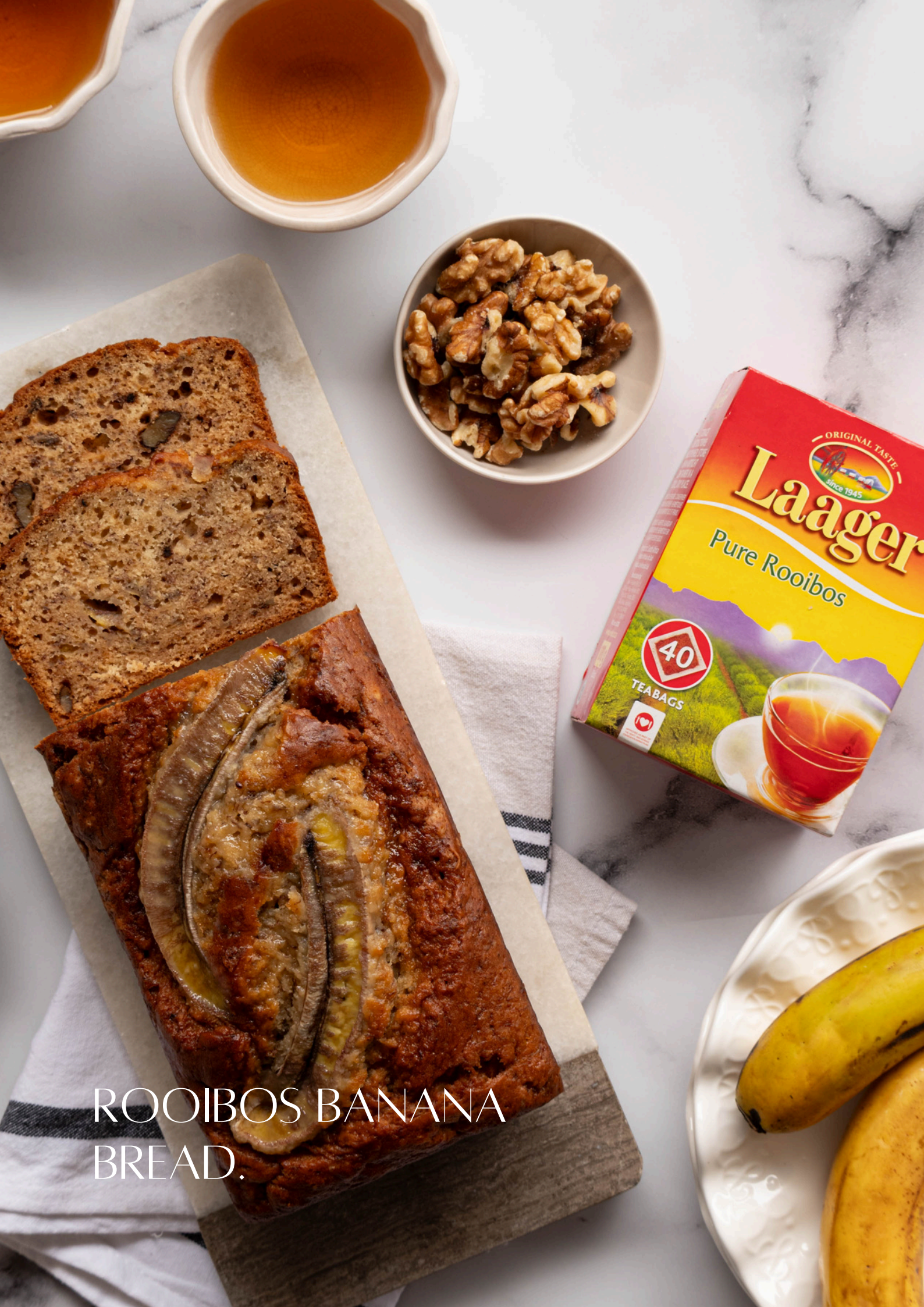
ROOIBOS BANANA BREAD.

ORIGINAL TASTE since 1945 Laager Pure Rooibos 40 TEABAGS